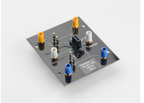
Figure 1: Model 8010-DTB-220

The 8010-DTB-220 is a device test board for testing 3-terminal devices in a TO-220 or TO-247 package and 2-terminal axial-lead devices. This test board is used with Keithley Instrument Models 8010 High Power Device Test Fixture and 8011 High Current Test Socket Kit.